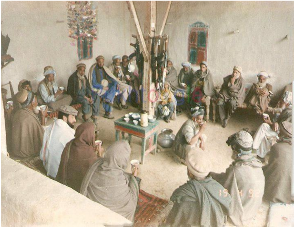
Hujra's Proceedings Underway